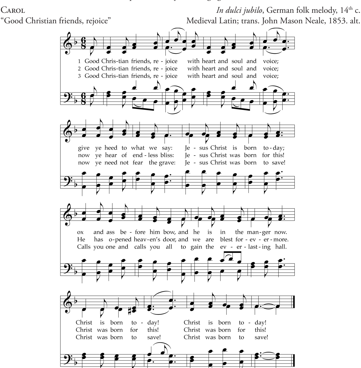
The People are seated.