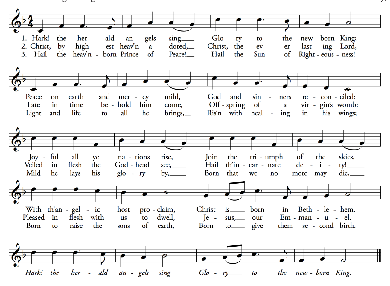
The People remain standing for the retiring procession.

Once the procession has passed, you are invited to remain seated quietly for the remainder of the voluntary. It is our custom at First Church not to applaud, but to respond "Amen." at the conclusion of the voluntary.